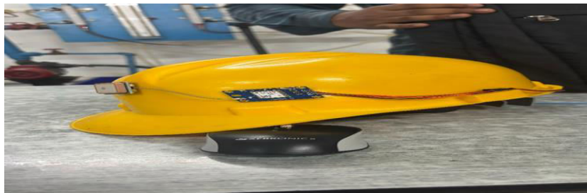
Fig 5.1 Design of model