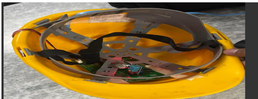
Fig 5.3 Working Model