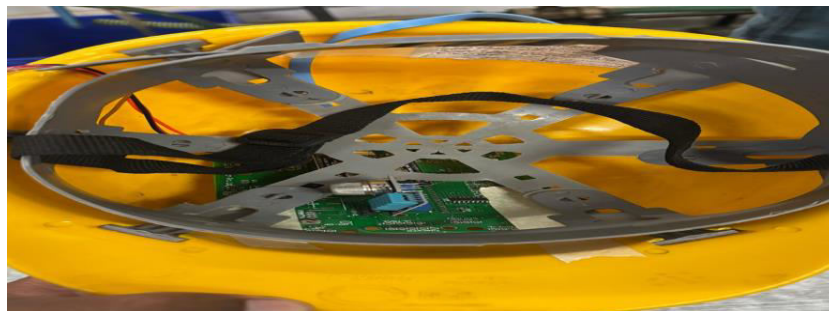
Fig 5.2 Equipment Setup